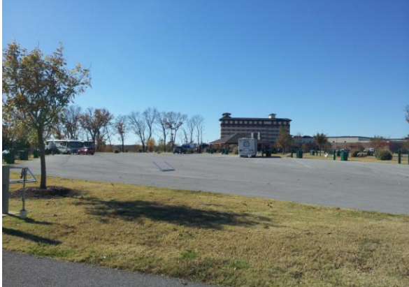
Indigo Sky Casino, OK