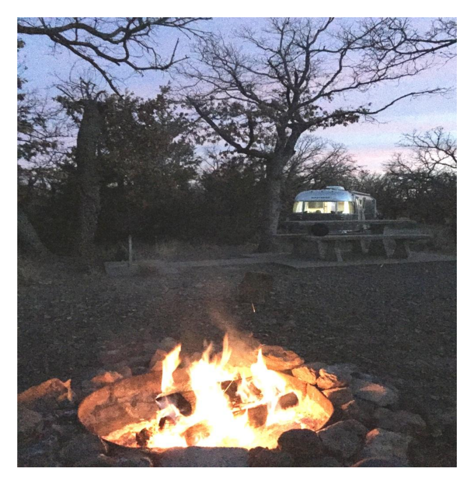
Camp Doris, Wichita Mountains, OK