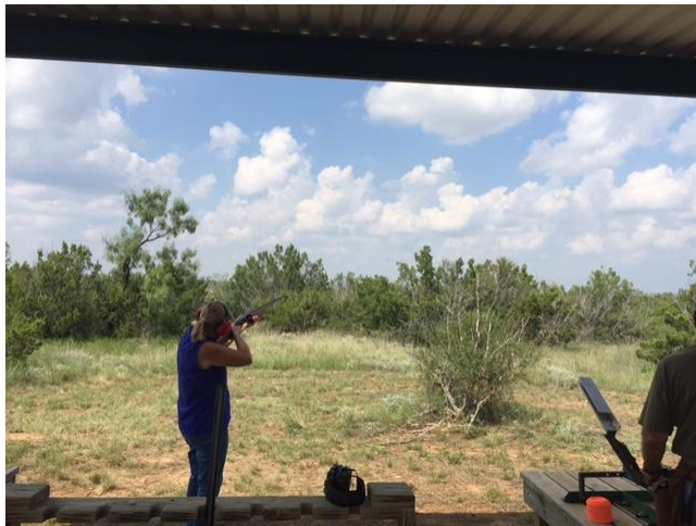
Jackie Skeet Shooting