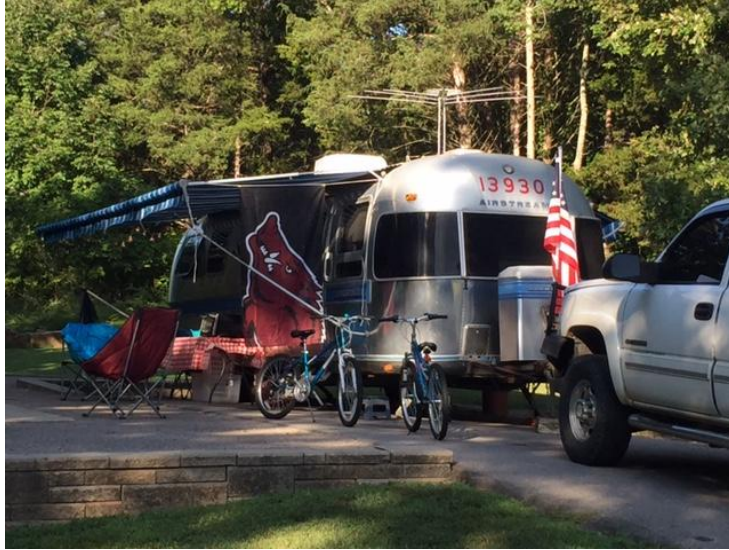
Fort Smith State Park