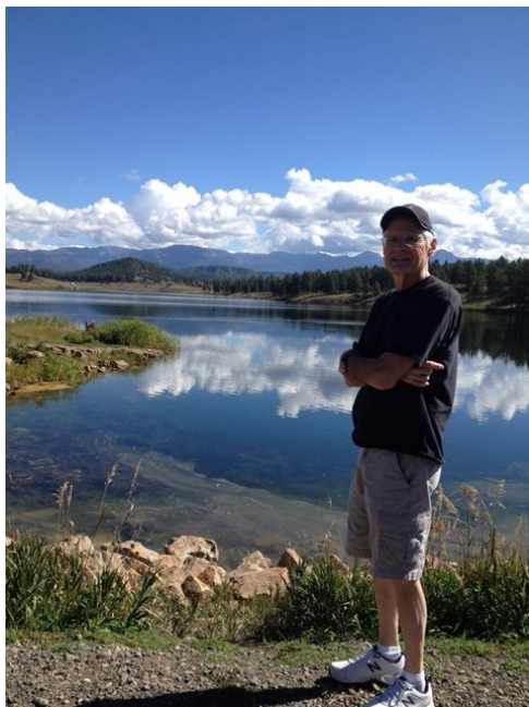
Echo Canyon Reservoir