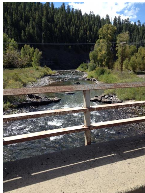
Pagosa Springs RV Park