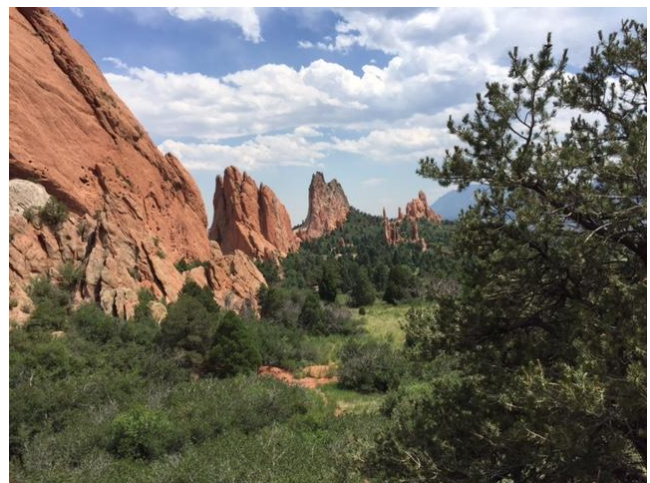
Garden of the Gods, CO Springs