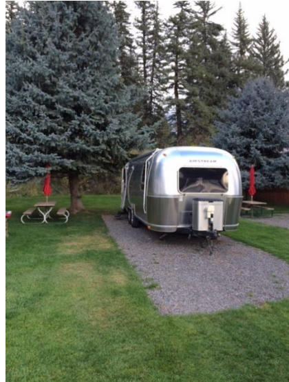
RV Park in Durango