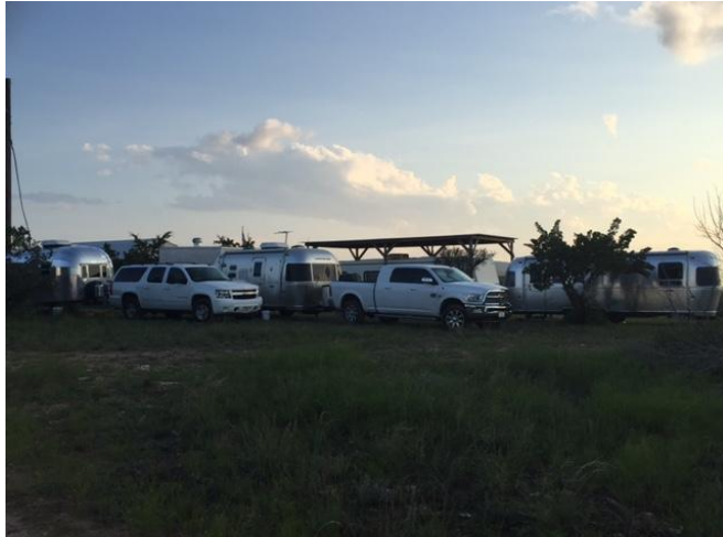
Robert Lee, TX