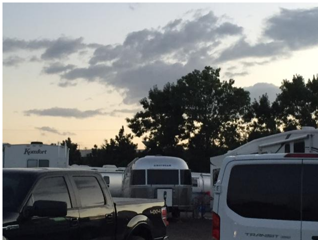
Jefferson Co Fairgrounds

While visiting Jackie's son in Denver we stayed a couple of nights at the Jefferson County Fairgrounds, Golden Colorado. The Jefferson County Fairgrounds RV Park is a great place to stay if you are interested in only having a staging area while you tour Denver and the surrounding area. With water and electric at each site and a dump station available, it's a great alternative to the higher priced (and less convenient) RV parks around the Denver area. It can get crowded so be sure to call ahead to schedule your visit.