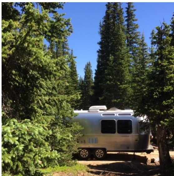
Brainard Lake, Ward CO