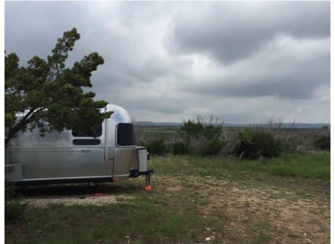
Robert Lee, TX