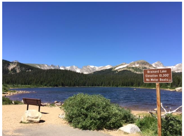
Brainard Lake Recreation Area