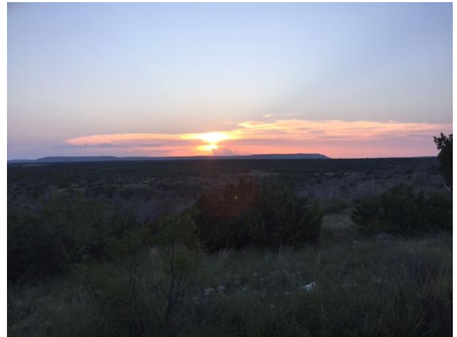
West Texas Sunset