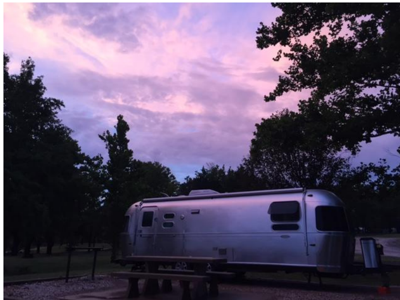
Twilight at Lake Tenkiller