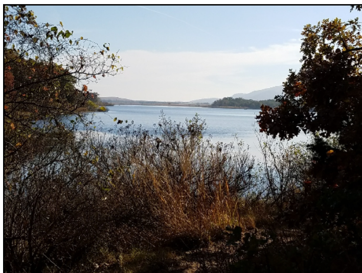
Quanh Parker Lake, Wichita Mts.