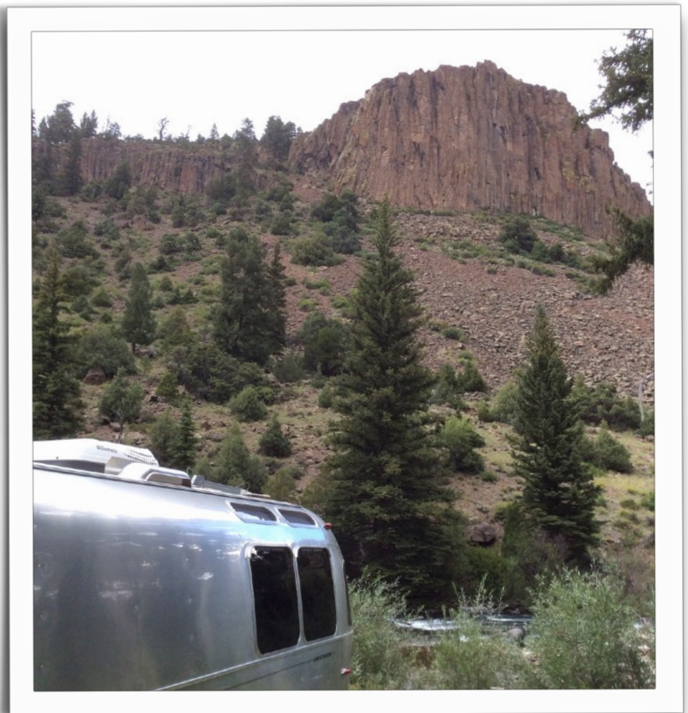
"The Gate" BLM Campground, north of Lake City, CO