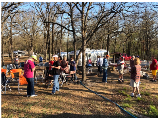
Gathering for evening festivities