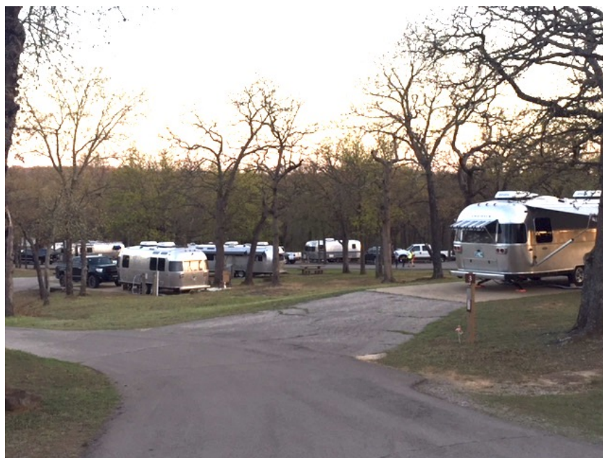
Osage Hills State Park, Bartlesville OK

Texas Country Air Rally (WBCCI Special Event Rally) Brownwood TX, Oct 25-28, 2018