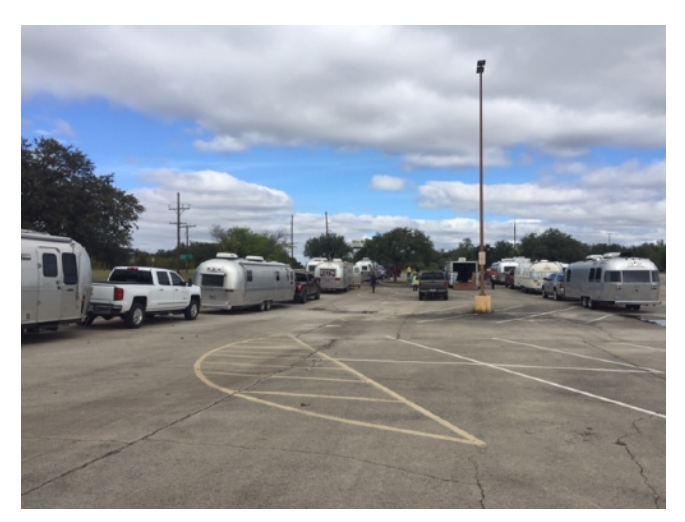
Arrivals lining up to be parked