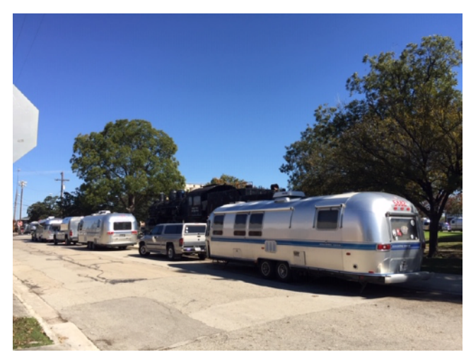
Urban parking along side street