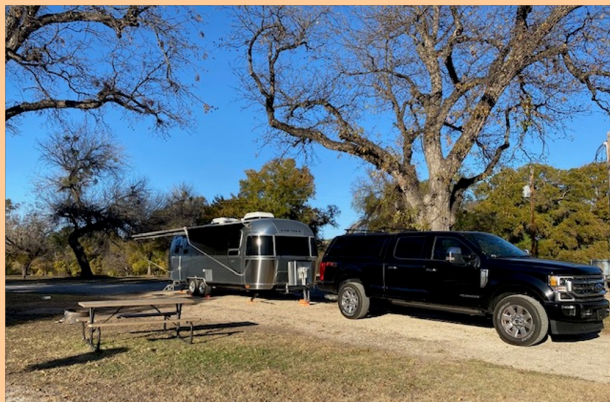
Campsite at Pecan Valley RV Park

This was our second trip to Big Bend National Park, so we were looking to cover ground we did not cover on the first trip. Just driving through the park and into Chisos Basin is worth the trip.