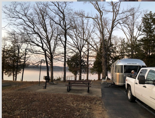
Setting up camp at Lake Dardanelle State Park