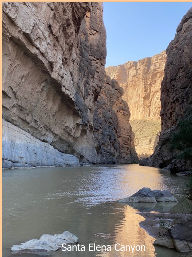
Santa Elena Canyon