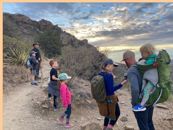
Family hiking along Lost Mine Trail