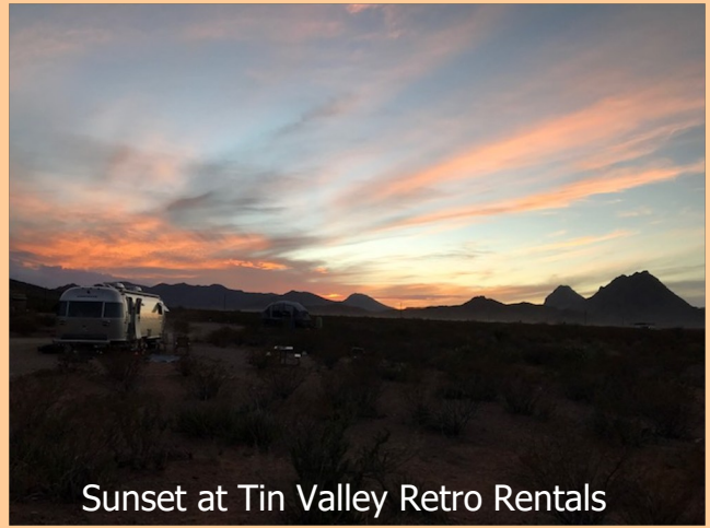
Sunset at Tin Valley Retro Rentals