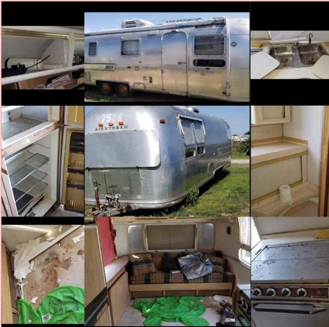
Photos of the Airstream on FB Marketplace listing – looks like quite the project, huh?!

So, here we are. In August 2020, we bought a 1975 Airstream Sovereign that we found on Facebook Marketplace. We honestly didn't know much about what to look for, other than the outside shell needed to be in decent condition and the frame/tires/hitch needed to be in working order (for the most part) enough that we could tow it off the lot and on the road 30+minutes to get it home. We set up an appointment and went to look at. It was a BIG project and it needed A LOT of work, but in true Orr "Remodelaholic" Fashion – we were drooling over the potential and we could see a clear vision of possibilities that could make it not only functional, but beautiful! We honestly didn't care much about the interior because we had essentially planned on taking it down to the shell anyway. We knew we would need to do that in just about anything we purchased for restoration because we wanted to have updated electrical, plumbing, and design anyway. So, this interior didn't scare us in the least bit!