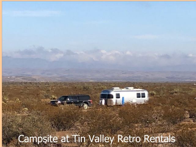
Campsite at Tin Valley Retro Rentals